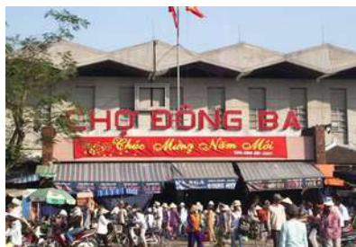
Dong Ba Market