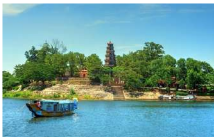
Thien Mu Pagoda