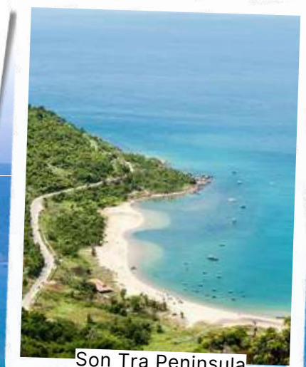
Son Tra Peninsula